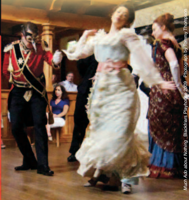
Much Ado about Nothing Blackfriars Playhouse 2009